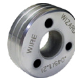
PFA Drive Rolls Various size options All PFA drive rolls are hard chromed and polished for maximum performance and durability. Sold individually.