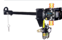
Extension Arm PFA-WM-EA Fits any Feed Assist Model.