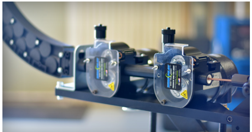
Tandem Wire Feed Assists Installed on a Mechanical Turn Table.